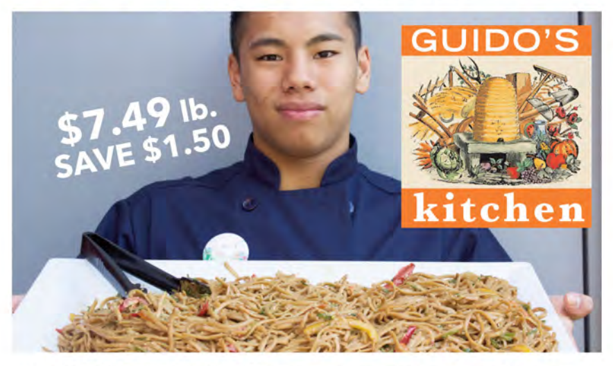
Our SESAME NOODLES are a perennial customer favorite. Let the summer picnics begin! ONLY IN PITTSFIELD