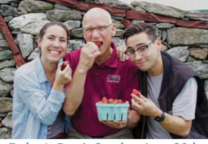
Father's Day is Sunday, June 20th